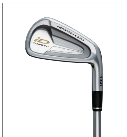
NEW iD FORGED IRON

Making full use of PRGR data, the NEW iD FORGED IRON also realizes a soft hitting sensation by inserting two layers of the silicon shock absorbent \alpha GEL inside the head, which reduces unpleasant vibration. Moreover, the iron uses the high-strength face material SAE8655M for a thinner face with higher initial velocity. The weight margin from the thinner face is effectively used in the center of gravity design to make the compact head easier to use. A different head thickness design is adopted for each iron, with the lower part of the head thickened for the long irons and the upper part of the head thickened progressing to the short irons. All the irons have the same center of gravity height (20.5mm) and center of gravity distance (37.5mm).